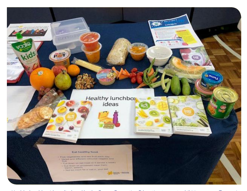
Healthy lunchbox ideas displayed by the Cancer Prevention Education team at exhibitions across Tasmania.