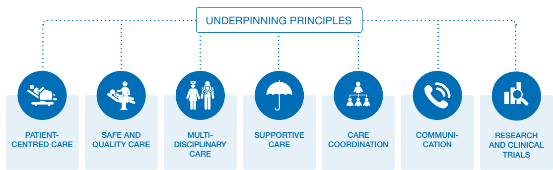
Figure 2: The seven principles underpinning the optimal care pathway

The seven principles of care define appropriate and supportive cancer care that is the right of all patients and the right of those caring for and connected with them.