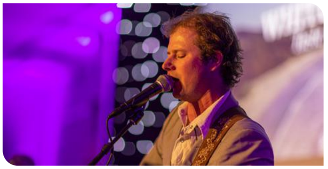
Sparkle for Hope Gala Ball

...to all our guests, supporters and volunteers who make our events such a success. 'Over $170,000 net revenue raised!'