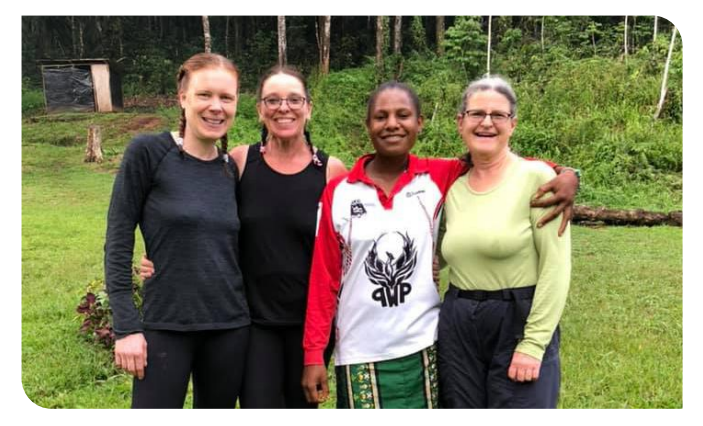
Our adventure challengers have returned absolutely exhilarated having just completed the life-changing experience of the Kokoda Challenge 2019. We are so proud of everyone's achievement and thank you all for your incredible efforts raising funds for Cancer Council Tasmania.