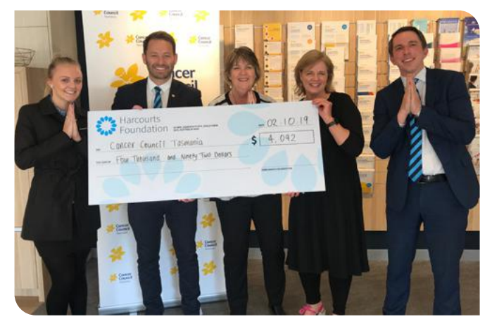
Thank you Harcourts Foundation for enabling Cancer Council Tasmania to continue to offer this wonderful program to our clients.

Client feedback has been very positive with one client who had recently completed the program describing it as "a valuable exercise in learning to like yourself and acceptance. I would thoroughly recommend that people try this course. Give it a try you won't be disappointed."