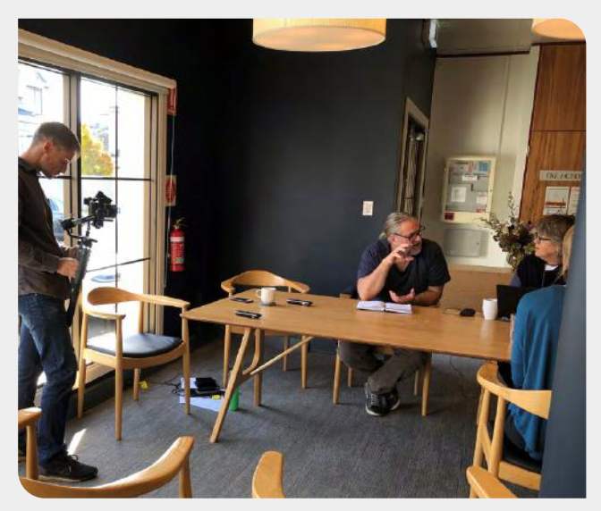
Support staff meeting staged for the camera.