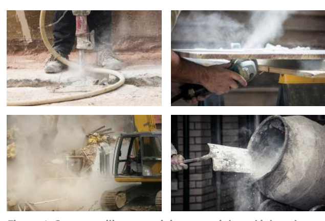
Figure 1: Common silica-containing materials and job tasks where you may be exposed to silica dust

Eliminate or reduce exposure to hazards by following the <u>risk management process</u> and using the hierarchy of control (Figure 2). Workers should always be involved in the process to correctly identify hazards and control measures that suit the workplace and task. If suitable control measures are not in place, anyone working around silica dust has an increased risk of developing lung cancer.