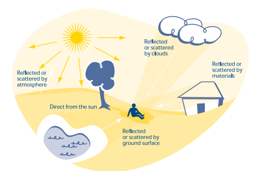
Figure 1. Direct and diffuse solar UVR

solar UVR can still damage the skin in the winter, so sun protectionis required wheneverthe UV Index is 3 or higher or when you are outside for long periods near highly reflective surfaces, e.g. snow or water.