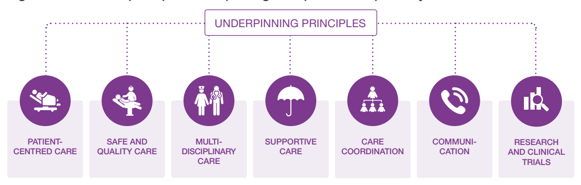
Figure 2: The seven principles underpinning the optimal care pathway

The seven principles of care define appropriate and supportive cancer care that is the right of all patients and the right of those caring for and connected with them.